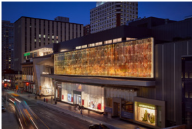
CF Rideau Centre Expansion & Renovation, Ottawa

Ottawa Urban Design Awards / Award of Merit: Urban Infill, Low Rise (Civic) / 2017